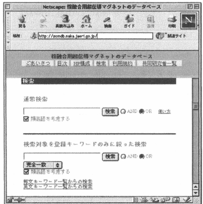
Fig. 2. Search page of the database for WWW. User can get a desired data by this search function.