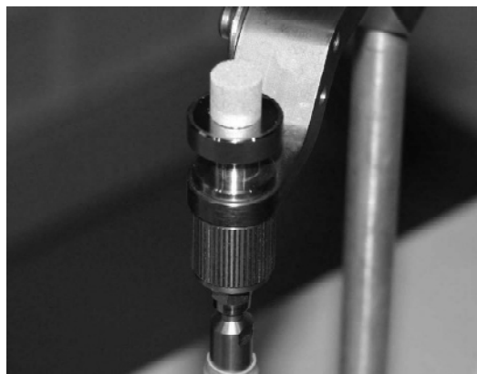
Fig. 1. Appearance of coaxial cable probe and metal powder compact sample.

Fig. 2. shows measurement result of dielectric constant (real part) at 2.45GHz for Al powder with varying apparent density. Measurement result for low density samples measured by coaxial cable method at 10GHz is plotted in the same figure. From this figure, it is obvious