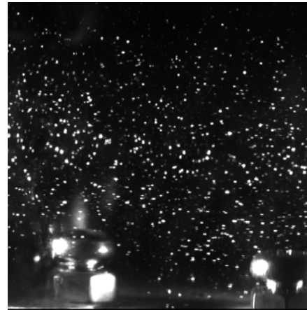
Figure 2 Tracer particles in liquid He at 1.6K.

CCD camera ( 1018 \times 1008[\text{pixels}] ) is used for visualizing the area 47[\text{mm}] \times 47[\text{mm}] . Double pulse YAG laser is operated to generate the laser sheet whose thickness is about 1[\text{mm}] . We used the polystyrene microspheres whose density is \rho_p = 145[\text{kg}/\text{cm}^3] and the diameter is d_p = 50[\mu\text{m}] . Figure 2 shows the visualized particles. They are carried by the thermal counter flow jet, but small density difference from the density of super fluid, the particles goes down gradually. We are thinking that this point should be improved in the next experiment.