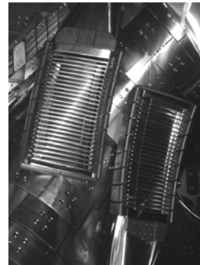
Fig. 1 HAS antenna in LHD

Through the discussion of the workshop the useful information for the research on ICRF heating was shared by many participants.