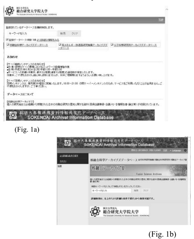
Fig. 1 Screen view of the top page of "SOKENDAI Archival Information Database" (a) and that of NIFS (b).

version, some screen views of which are shown in Figs. 1a, 1b. In October 2012, we started trial use of version 4, and after some preparations and data transport into version 4, in December 2012 moved to operation under version 4.