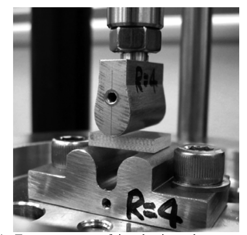
Fig. 1. Test apparatus of interlaminar shear strength of electric insulation composite. 11 sheets of glass cloth and 10 sheets of polyimede film were interlaminated. 3-point bending test was carried out in liquid nitrogen.