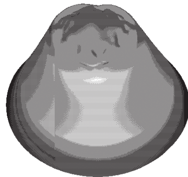
Fig. 2: Bird's eye view of total pressure profile at t = 80,000\tau_A .