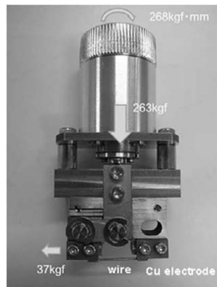
Fig.1 The conceptual design of applied uniaxial tensile strain mechanism on transport I_c measurement at 4.2K under various higher magnetic field.

In order to realize the uniaxial tensile mechanism, we carried out the stress analysis of the constructional element using ANSYS system. The configuration design and ANSYS stress analysis of applied uniaxial tensile strain mechanism are shown in Fig.2. We found that the linear force about 550 kgf and torque with 415 kgf · mm were necessary to apply the tensile strain over 1.0 %.