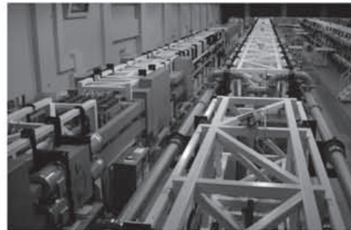
Fig.1 Present outlook of LFEX (heating laser for FIREX-I).

integrated simulation studies are in advance. In the test operation of LFEX, out put of 3kJ/beam/1.06 \mu\text{m} was achieved recently. A conceptual reactor design is completed which discloses future issues of fast ignition research. [2]