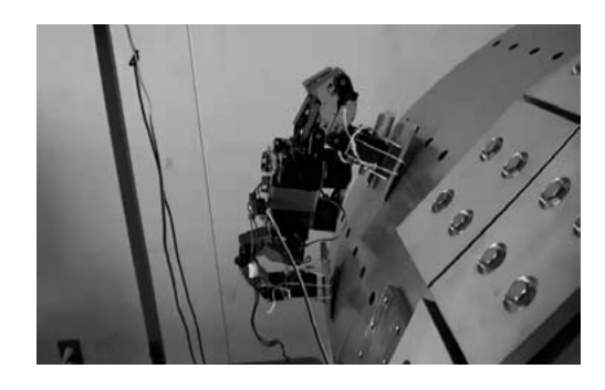
Fig. 2: The TLR climbing up the curved wall.