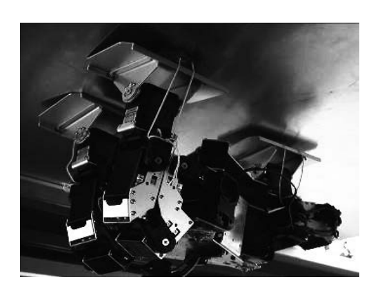
Fig. 1: The inverted walking on the roof by using the suckers.

Figure 2 shows the curved surface whose curvature is similar to the reactor. This experimental field is lent from NIFS. In the experiments, the flexibility of the resin suckers copes with the curved surface adaptively and passively, and thus the TLR can climb up stably.