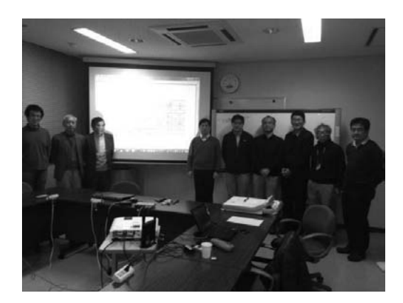
Fig. 1. Group-photo of the seminar at NIFS on December 16-17, 2013.

samples were measured by SQUID without zero correction (Quantum Design MPMS-XL7). Fig. 3 shows the hysteresis loop of magnetite at 300 K. From TEM and SQUID data, it is suggest the sintered magnetite under magnetic field of microwave has super-ferrimagnetism.