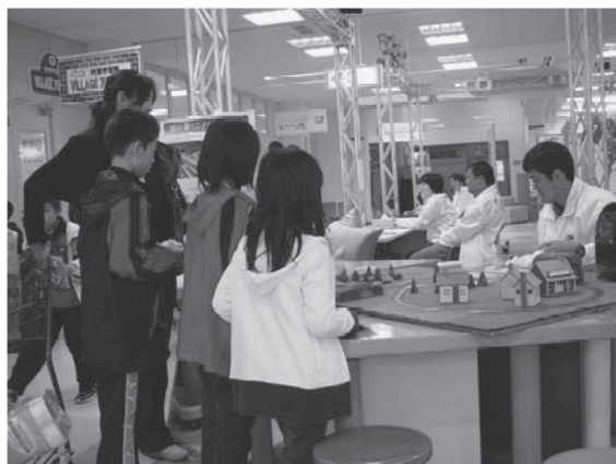
Fig. 3 Publicity work in Rokkasho village