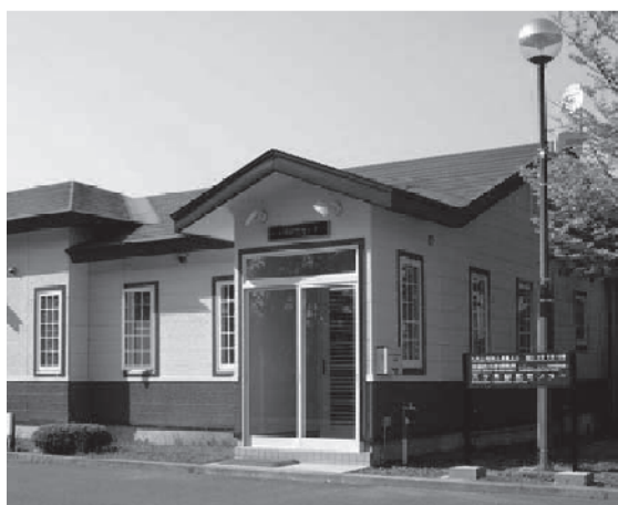
Fig. 1 Outside of Rokkasho Research Center